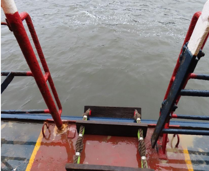
Rigging the ladder, ladder in position (gate opens to the right of picture)

Fri Sea's safety management system did not include a permit to work for work over the side because they did not recognise that any work over the side was being conducted as part of the ship's operations. This blind spot was absolute: there were no lifejackets onboard that were suitable for working and crew could not identify a time when they had been required to work over the side. Witness testimony and demonstration of the process of rigging the pilot ladder included the crew "testing" the ladder using their own body weight on the topmost rung (outboard of ships rails).