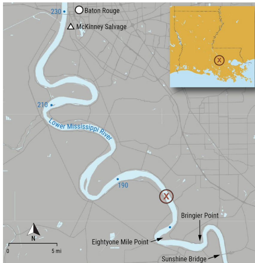
Figure 2. Area where the Uncle Blue flooding occurred, as indicated by a circled X.