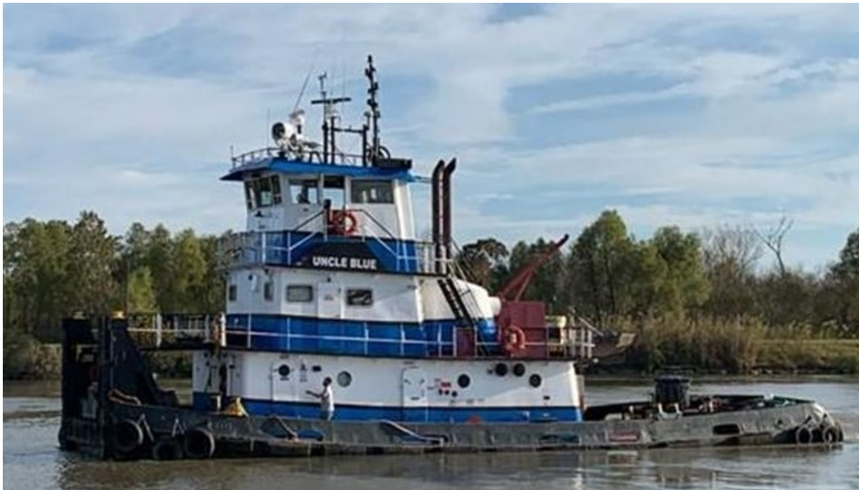
Figure 1. Uncle Blue underway in 2019.

On March 26, 2023, about 0500 local time, the towing vessel Uncle Blue was towing one empty barge on the Lower Mississippi River in Ascension Parish, Louisiana, when the vessel began flooding (see figure 1 and figure 2). 1 The six crewmembers aboard attempted to pump out the vessel but were unsuccessful, and they evacuated to the barge. A Good Samaritan vessel pushed the towboat and barge to the right descending bank, where the Uncle Blue partially sank. There were no injuries, and no pollution was reported. Damage to the vessel was estimated at $500,000.