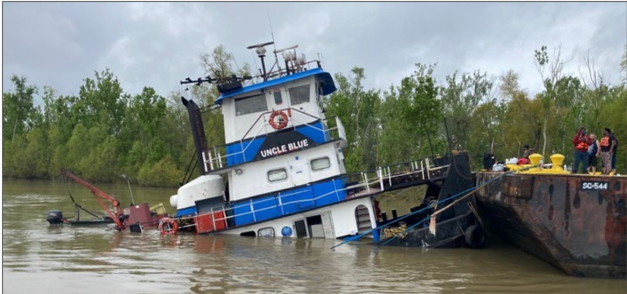
Figure 4. Uncle Blue partially sunken.