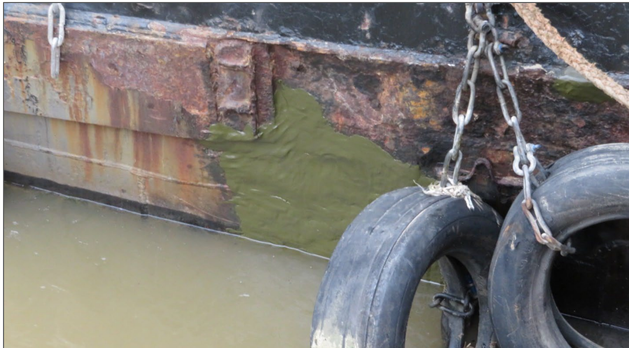
Figure 5. Temporary epoxy repair, applied during the postcasualty salvage, on the port quarter, near the lazarette, with an existing doubler plate just above and to the left.

Uncle Blue was originally outfitted with rods used for rudder angle feedback (feedback rods). Although the feedback rods were no longer used, they were still in place within conduits (about 2-inch-diameter pipes) that passed from the lazarette to the engine room. Investigators noted that the conduits were either corroded or missing where they passed through the voids (see figure 6). The conduits were intact where they passed through the fuel tanks. These conduits were unsealed on their ends, and if there was flooding of the lazarette, they would have allowed progressive flooding of water from the lazarette to the voids and the engine room.