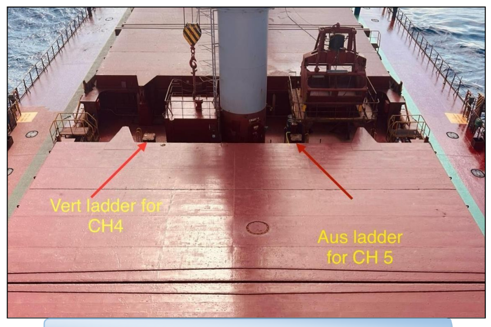
Figure 3: Representative image of booby hatch on a bulk carrier