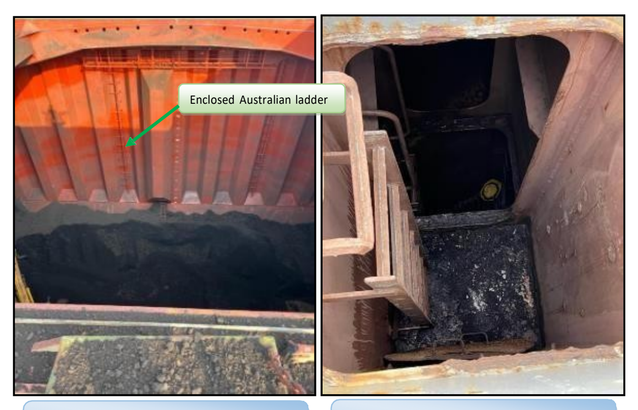
Fig 3: Australian Ladder with enclosed dome

further exacerbates the risks associated with entering enclosed spaces, turning routine tasks into potential death traps.