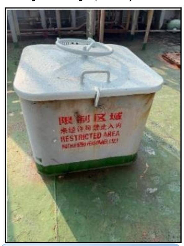
Figure 1: No: 5 Booby hatch with lashing wire (number not marked) – Incident 1

This circular is issued considering two unfortunate incidents that occurred recently at Indian Ports resulting in tragic loss of two stevedores and one excavator-operator onboard the vessels. Both the casualties occurred due to entry of personnel into the cargo hold which was in closed condition and not checked for atmosphere suitability prior entry. The incidents occurred as the personnel entered through the booby hatches, however, in one of the incidents, there was a lack of adequate marking for the cargo space they served.