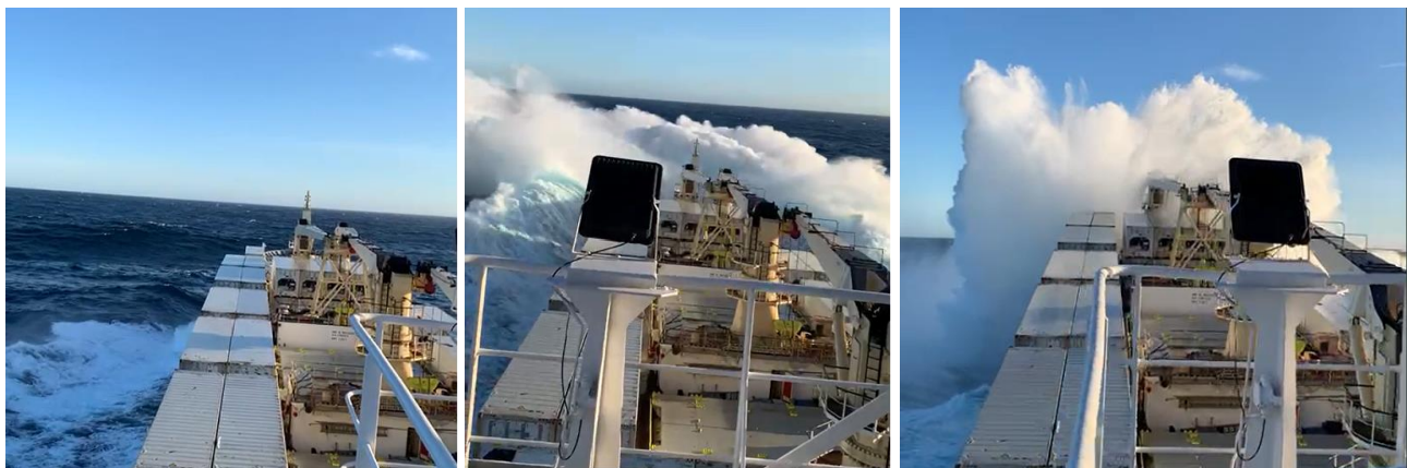
Conditions of weather as seen from the bridge one hour post-casualty

Due to the forecast, the chief officer held a shipboard safety meeting with all crew present on the 29 June 2023. The wind direction, strength as well as predicted wave heights was shared along with an emphasis on crew duties during "bad weather."