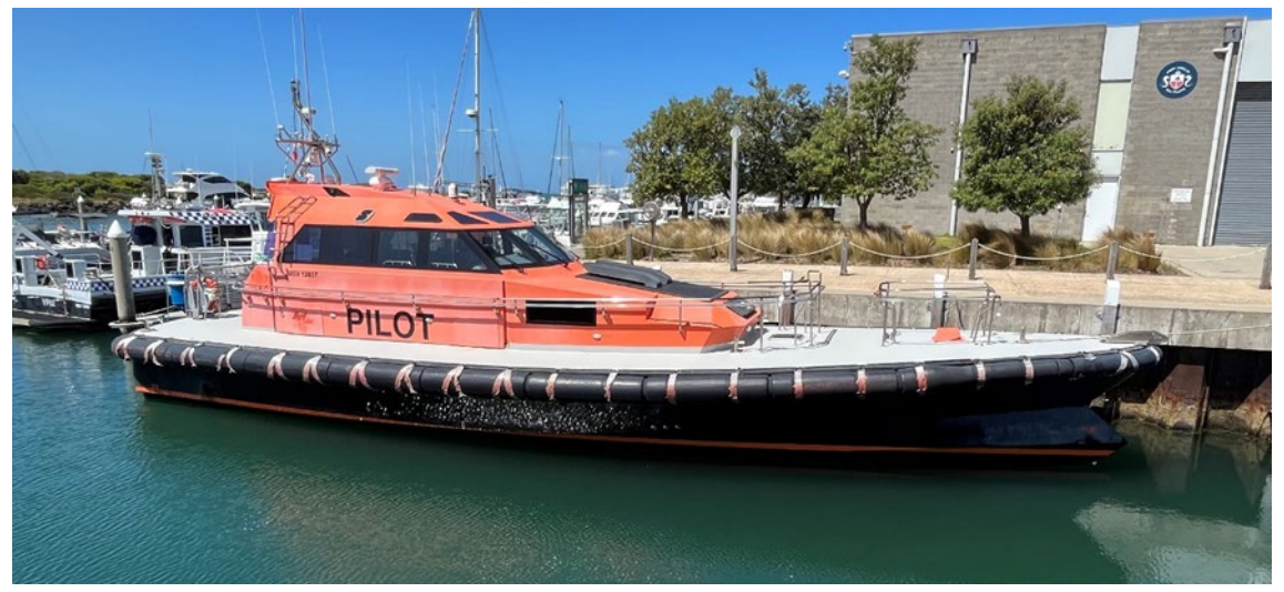
Figure 4: PV Nepean, the sister vessel of PV Corsair