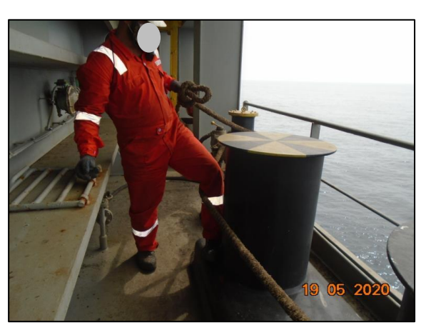
Figure 5: A photo simulation of the bosun's left leg getting caught in between the pick-up gear and the mooring bitts