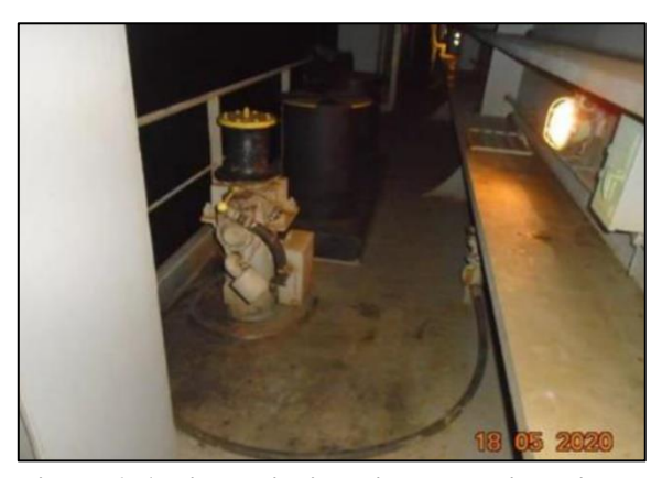
Figure 6: Accident site illuminated at night-time

Additionally, since the operation was being carried out during night-time, the crew had to rely on the fixed illumination fitted on deck, which emitted a yellow light (Figure 6).