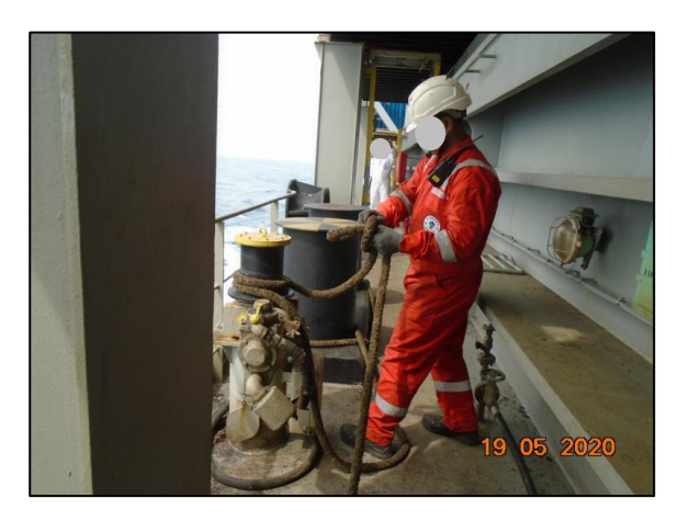
Figure 4: A photo simulation of the bosun attempting to disconnect the messenger line and the pick-up gear

At 2118, the eye of the tug's line reached the waterline, and the chief officer reported to the bridge that the forward tug was cast off. At this time, while the pick-up gear was still moving under tension, the bosun noticed that the vessel's messenger line was still attached to the pick-up gear by a knot. While he attempted to disconnect these ropes<sup>6</sup> (Figure 4), his left leg was caught between the pick-up gear and the mooring bitts (Figure 5).