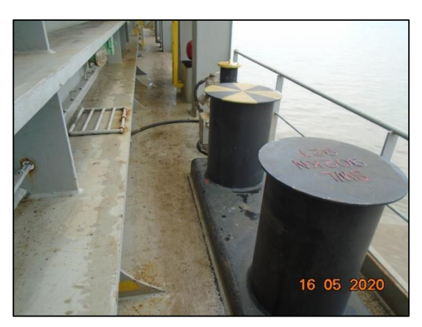
Figure 1: Mooring bitts where the tug's line was made fast for departure

Fixed artificial lighting illuminated the site.