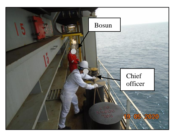
Figure 2: A photo simulation of the bosun holding on to the pick-up gear and the chief officer clearing the eye of the tug's line from the mooring bitts

ordered the forward party to cast off the forward tug's line. Upon arriving near Bay 15, the bosun cleared the pick-up gear of the tug's line and made turns of it around the nearby capstan, to release the tug's line from the vessel's mooring bitts. Once tension was taken on the capstan, the chief officer cleared the tug line's eye from the mooring bitts (Figure 2).