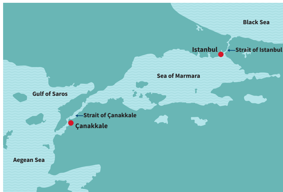
Figure 1: Map of the Turkish Straits

The Turkish Straits are some of the busiest waterways in the world. They are the only waterway connection between the Black Sea and the Mediterranean Sea and more than 3% of the global oil supply passes through them. On average, 50,000 vessels per year transit through the Istanbul Strait (also referred to as the Bosphorus) and the Çanakkale Strait (also referred to as the Dardanelles), or approximately 130 vessels per day, with around 20% being oil tankers or gas carriers. The average size of vessels and cargo carried has steadily increased and, therefore, so has the overall level of risk.