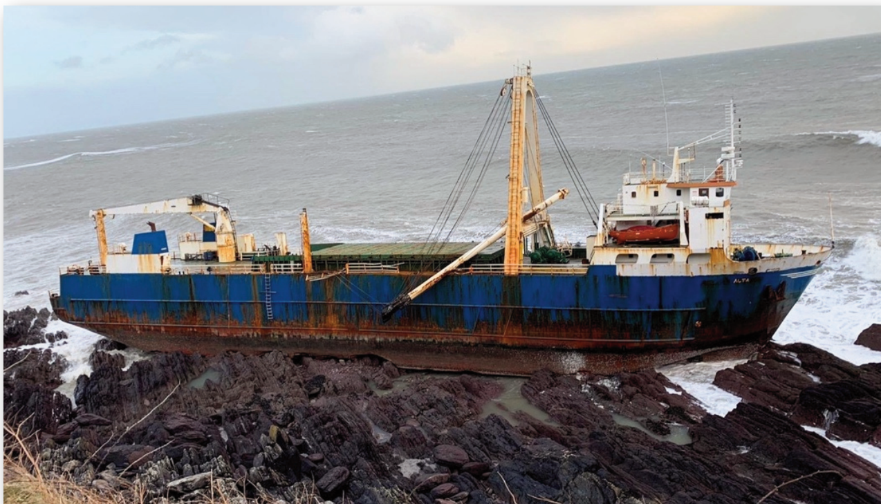
Photograph No.1 - 'MV Alta' aground in Ballyandreen Bay, Co. Cork.