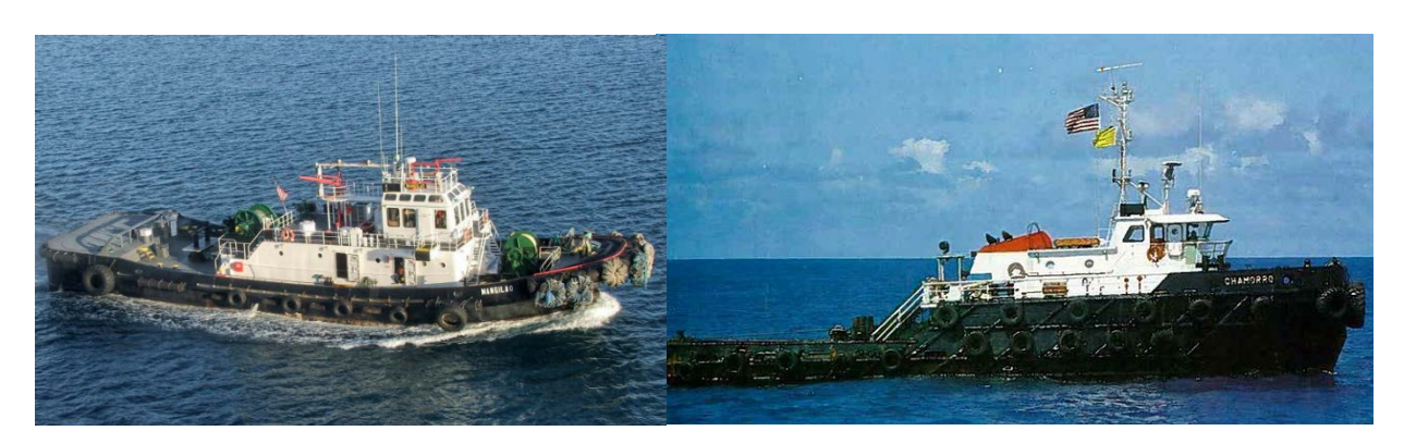
Mangilao (on left) and Chamorro (on right) under way prior to the accident voyage.

On August 05, 2019, about 0439 local time, the towing vessel Mangilao was under tow by the towing vessel Chamorro , about 800 miles northwest of Guam in the Pacific Ocean, en route to a drydock in Subic Bay, Philippines, in a developing storm. The towline to the unmanned Mangilao parted, and the vessels separated. The Chamorro retraced its route and found the Mangilao taking on water, and the Mangilao eventually sank. The Chamorro continued to the Philippines with its crew of 10. No pollution or injuries were reported. The Mangilao was lost, with an estimated value of $437,227.