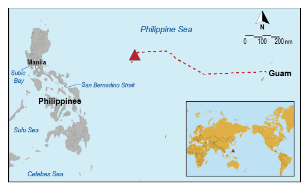
Area of accident where Mangilao sank, as indicated by the red triangle.