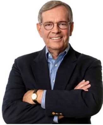
GOVERNOR MICHAEL LEAVITT, CO-CHAIR

Leavitt Partners, Founder Former Governor of Utah Former Secretary of Health and Human Services