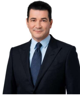
DR. SCOTT GOTTLIEB, CO-CHAIR

Leavitt Partners, Founder Former Governor of Utah Former Secretary of Health and Human Services