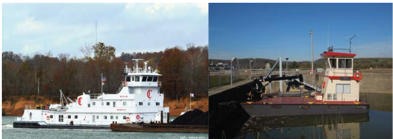
Left: Towing vessel Mary Lucy Lane. Right: Corps of Engineers workboat Gibson.

About 1555 on December 18, 2018, the towing vessel Mary Lucy Lane , with eight crewmembers on board and pushing a tow of 12 barges, was locking southbound at the Markland Locks & Dam (L&D) at mile 531.5 on the Ohio River, when the tow struck the lock's wall, then its guard wall. Several barges broke loose and continued forward, one of which collided with the moored US Army Corps of Engineers workboat Gibson . No injuries or pollution resulted from the accident. Damage to the Mary Lucy Lane , the barges, and the dam was estimated at $321,943, and the Corps of Engineers estimated the cost to replace the Gibson at $1.8 million.