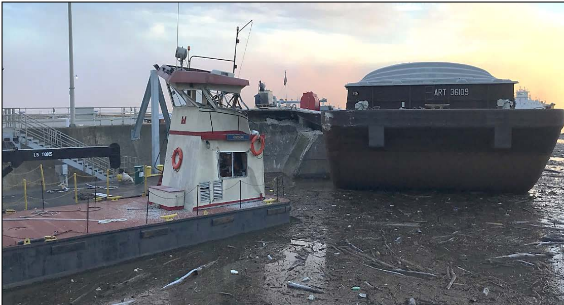
The Gibson and barge ART 36109 three days after the accident.