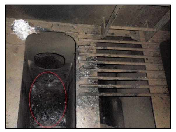
Figure 6: Bilges inside the forepeak tank