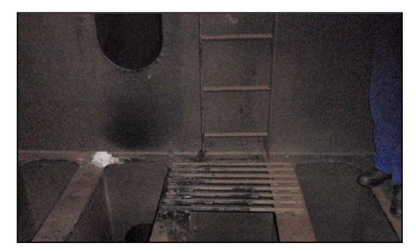
Figure 5: Vertical ladder on platform no. 5

Soon after, both fitters' clothes were on fire; while fitter 2 managed to reach the ladder and climb up to the upper platform (Figure 5), fitter 1 did not manage and remained trapped inside the bilges of the forepeak tank (Figure 6).