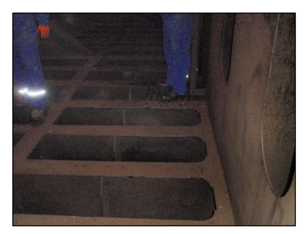
Figure 3: Platform no. 5 with deep wells

The depth of the bottom longitudinal girders was about 1.9 m, and the face plates were about 0.25 m wide, providing just enough stepping space.