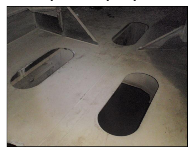
Figure 2: Configured platform nos. 1 to 4

While platform nos. 1 to 4 were fully configured platforms with access and drain openings (Figure 2), the bottom most platform no. 5 (where the accident happened) was structured differently, with deep longitudinal girders and face plates of the bottom longitudinal stringer (Figure 3).