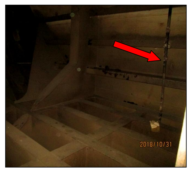
Figure 4: Valve spindle inside the forepeak tank

spindle passing the whole height of the tank, split in sections by cardan joints and supported at several locations through the platforms. The valve spindle (Figure 4) was located about 1.5 m from the access ladder.