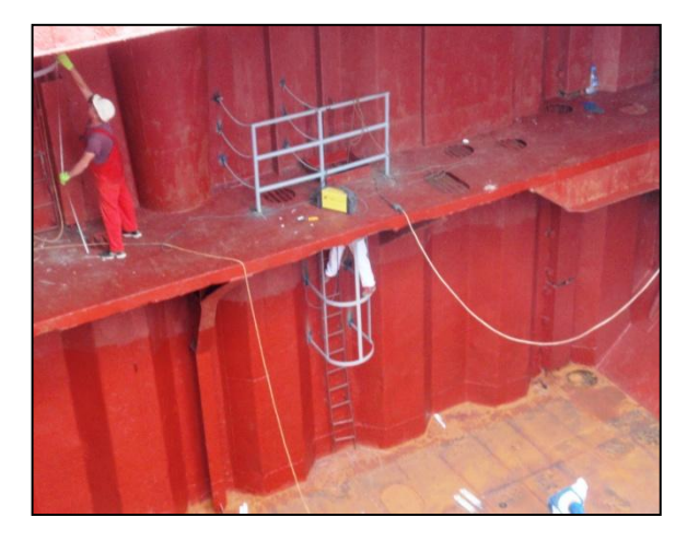
Figure 5: Physical barrier systems fitted after the accident

Railings and cages around access ladders were installed on the tweendeck platforms.