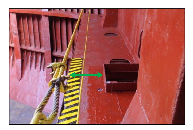
Figure 4: Narrow tweendeck platform in cargo hold no. 1 (post accident photo showing the wire rope)

It was also noticed that had Seafarer A proceeded immediately to the ladder leading to the tanktop in the cargo hold, Seafarer B would not have lost sight of him. This was therefore indicative that Seafarer A was engaged in doing something else whilst standing on the narrow tweendeck platform (Figure 4) ( e.g. , arranging the lights).