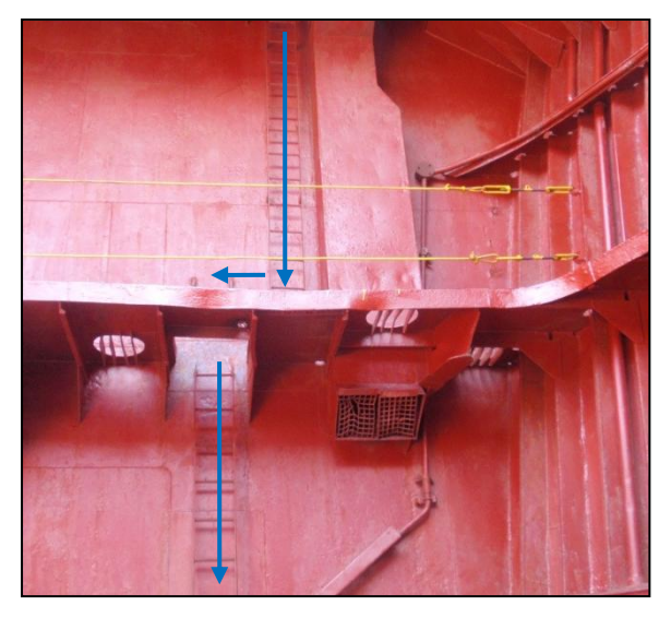
Figure 3: The way towards the lower cargo hold (yellow wire rope was fitted after the accident)

Soon after, Seafarer B heard a noise coming from the cargo hold. He called Seafarer A several times and getting no response, he went down the ladder to tweendeck platform. From that position, he saw Seafarer A on tank top of the cargo hold facing down. Seafarer A had also lost his safety helmet as a result of the fall.