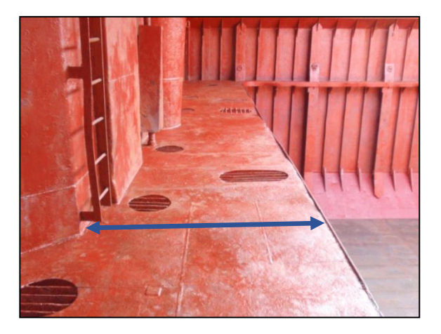
Figure 5: A much wider forward tweendeck platform inside cargo hold no. 2 (although the absence of physical and symbolic barrier systems are apparent)

It would also appear that these were very critical systems in cargo hold no. 1 (where the accident happened), given that in comparison to the tween deck width in cargo hold no. 2 (Figure 5), the former was much narrower.