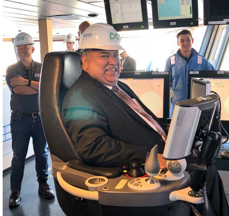
Photo: Nauru President Baron Waqa dons a DeepGreen hard hat to celebrate the launch of the NORI exploration vessel in San Diego, April 2018.

Nauru is a small nation consisting of one island and a population of around 13,000 people. Nauru's colonial-era history of terrestrial mining has been described as one of the world's worst environmental disasters. 57 During the colonial period,