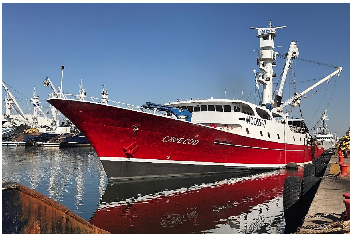
Cape Cod in port.

On May 20, 2018, at 1536 local time, fishing vessel Cape Cod experienced an engine room fire while moored in Pago Pago Harbor on Tutuila Island, American Samoa. The vessel was in port to offload a cargo of fish at the Samoa Tuna Packing dock with 20 crewmembers on board. The fire caused extensive damage to the engine room, including generators and electrical distribution systems, before crewmembers extinguished it using the fixed firefighting system. No pollution or injuries were reported. Damage to the vessel was estimated at $650,000.