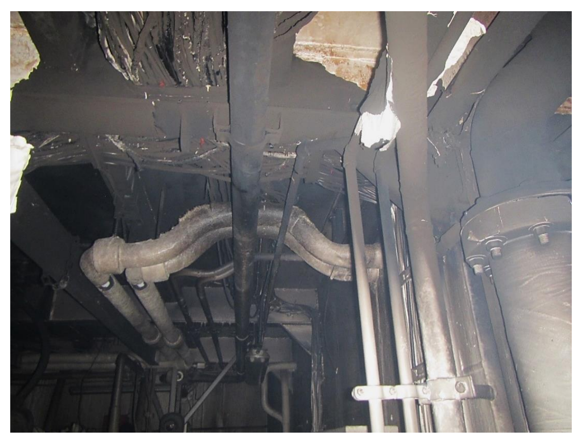
Smoke and heat damage in the overhead of the starboard forward corner of the lower engine room.

Investigators also reviewed available the closed-circuit television (CCTV) footage. Although ducting blocked the origin of the fire in the CCTV footage, the glow of the fire seen in the video revealed a quick and intense ignition with little smoke, suggesting an electrical ignition source forward of generator no. 2. Also, the engine room appeared clean and free of loose combustibles. The crew's initial response with portable extinguishers was ineffective, given that the electrical power near the fire had not yet been shut down.