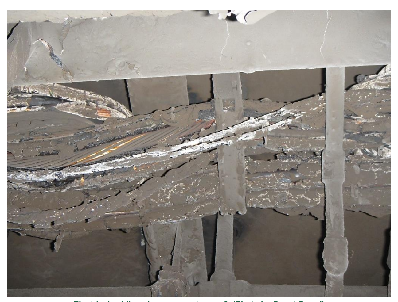
Electrical cabling above generator no. 2.

Based on the location of the damage in the engine room, the intensity of the fire observed in the CCTV footage, and the lack of operating machinery near generator no. 2, investigators concluded that the fire likely resulted from an electrical source and was fueled by electrical cable housing material, control boxes, light fixtures, and paint. The vessel had recently undergone extensive work in the engine room, although with no subsequent regulatory or classification society drydock exam or sea trial.