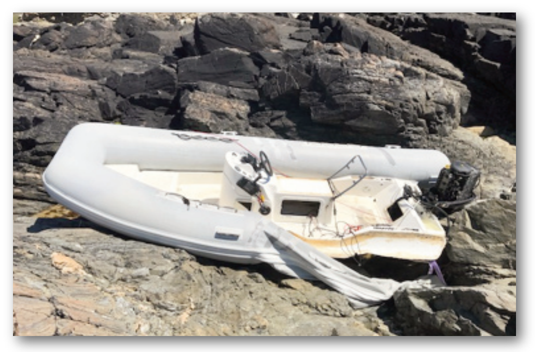
Photograph No. 2: Vessel as found after the incident.