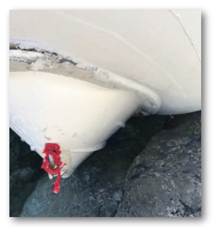
Photograph No. 7: Rigid hull damage.