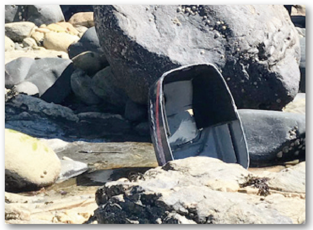
Photograph No. 5: Engine cover in debris field.