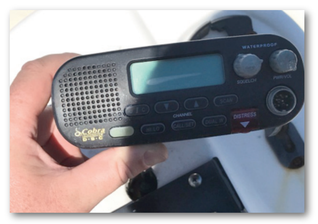
Photograph No. 8: VHF without hand held microphone.