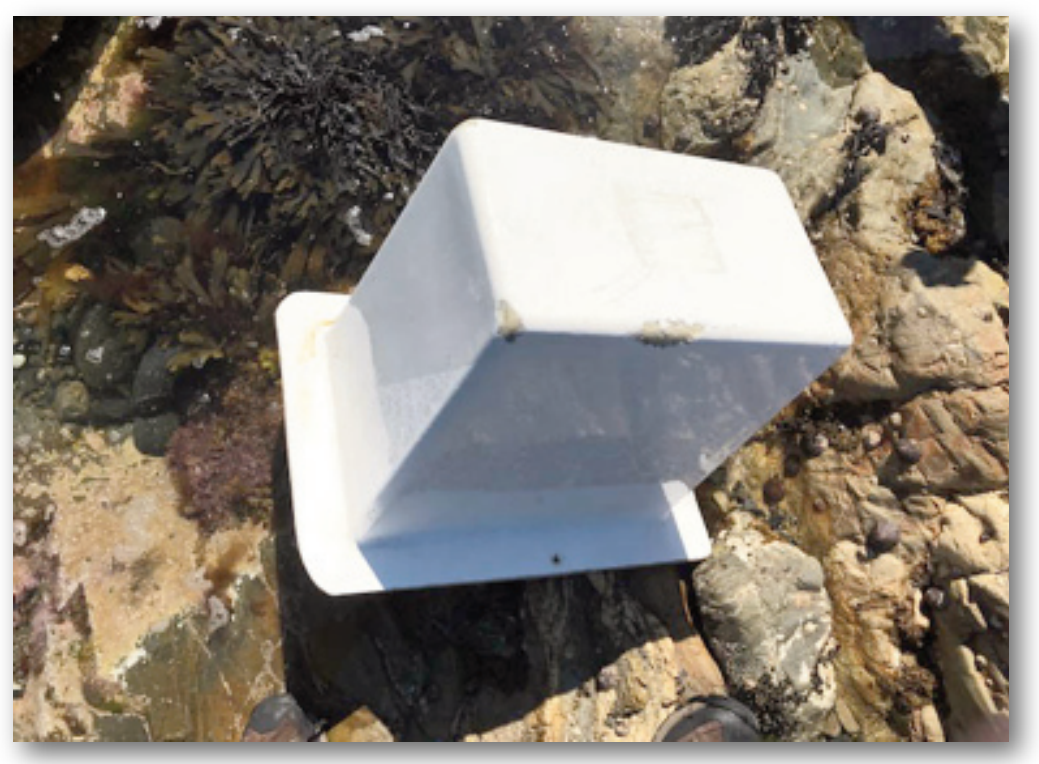
Photograph No. 9: Extra centre seat found in debris field.