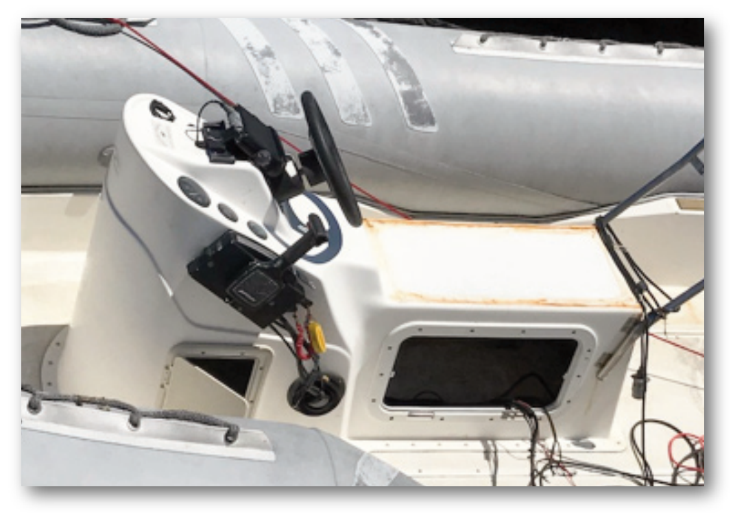
Photograph No. 4: Battery cover in console broken out.