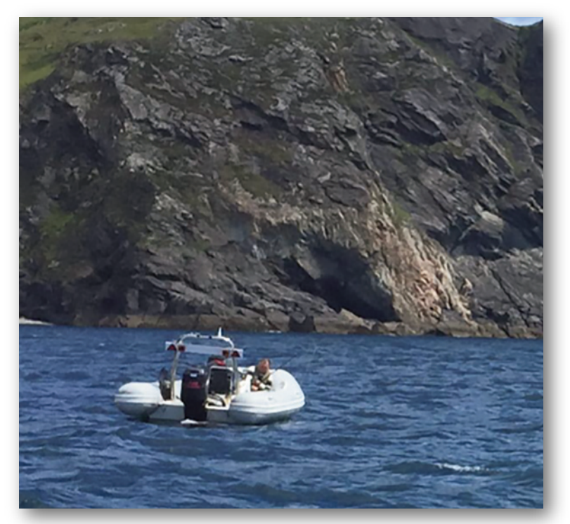
Photograph No. 10: Photo of the men fishing.