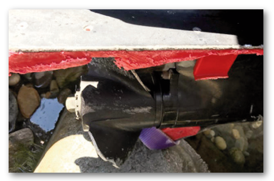
Photograph No. 6: Propeller blades damage.