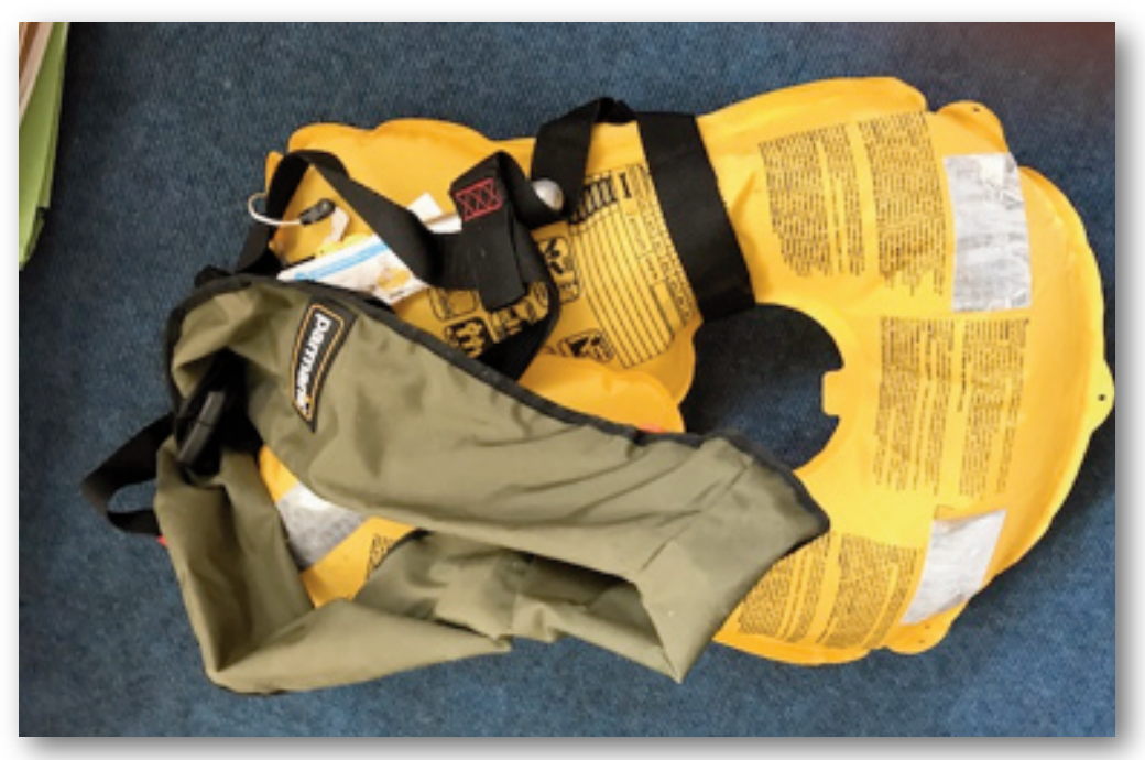
Photograph No. 1: PFD recovered in debris field.