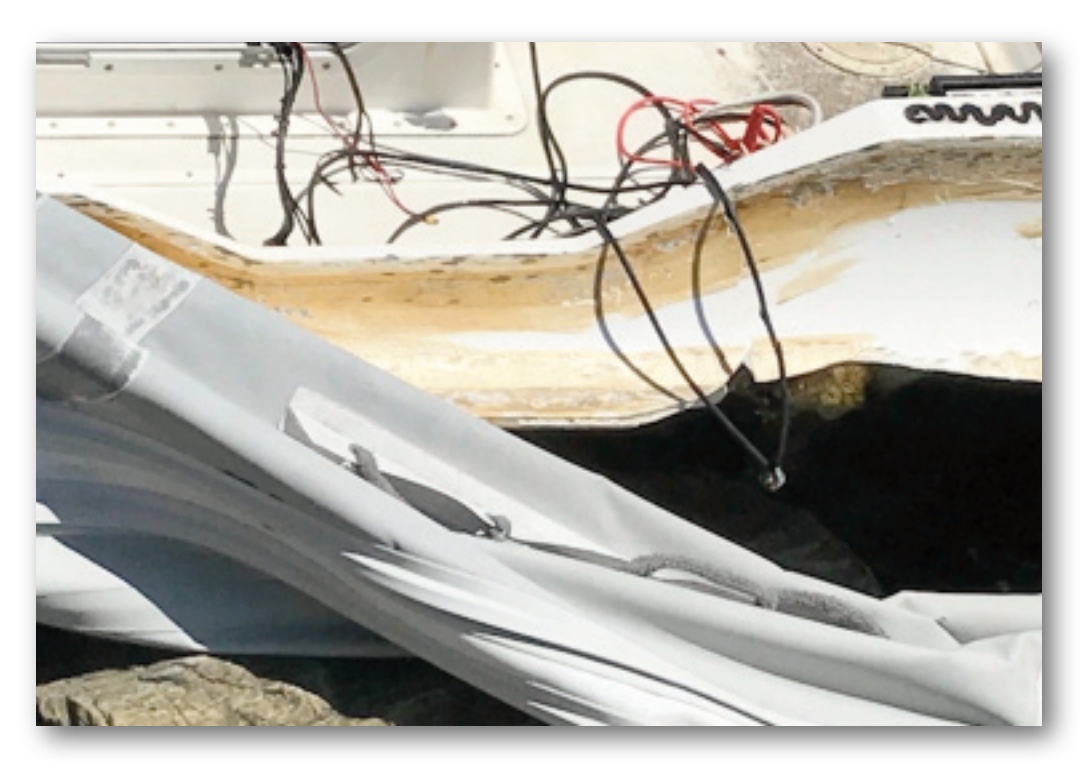
Photograph No. 3: Aft port tube torn away from hull.