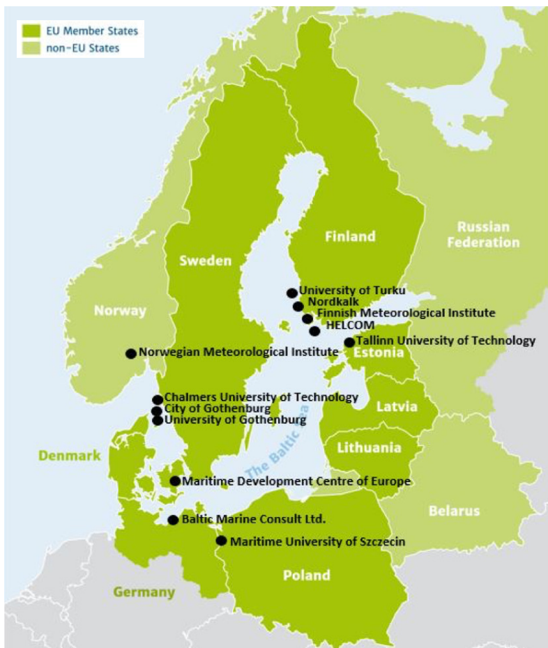
Fig. 10. EnviSuM project area and project partners

Focuses on assessing the effect of ship exhaust gas emissions on air quality and depositions before and after the introduction of SECA regulations in the Baltic Sea in the beginning of 2015. The emission measurements conducted in WP2 as well as modelling are used to estimate air quality at a