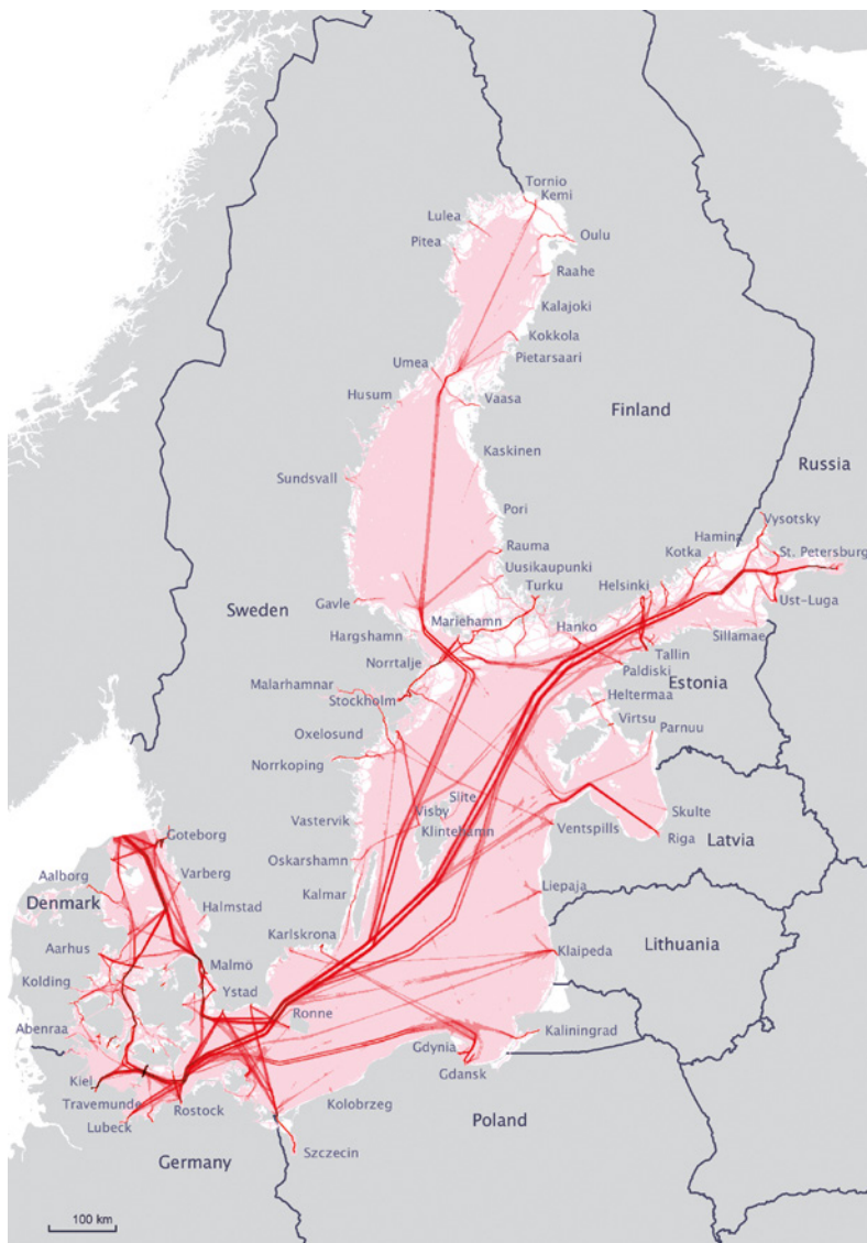
Figure 1. Ships in the Baltic Sea (based on HELCOM AIS data from 2006 to 2016 including cargo, tanker, passenger and container ships which account for 80% of the traffic of the larger (IMO) ships).