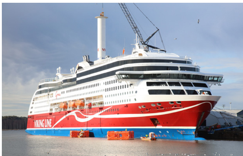
Fig.6. The Viking Grace is the first LNG fuelled ship in Finland. It is also equipped with a rotor sail unit.