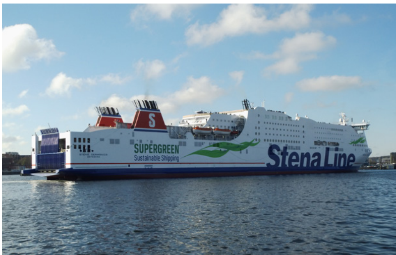
Fig.7. Stena Line's first methanol powered ferry, the Stena Germanica

The HH Ferries Group's two ferries, the Tycho Brahe and the Aurora, operate a 4-km (2.5 miles) ferry route between Helsingborg (Sweden) and Helsingør (Denmark). Therefore, the route that they are converting to all-electric transport is not exactly impressive, but the actual ships themselves are something. They are 238 meters long (780 ft) and weight 8,414 tonnes. They carry 7.4 million passengers and 1.9 million vehicles annually.