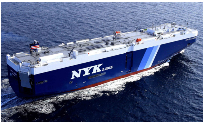
Figure 3. Auriga Leader is a car carrier owned by Nippon Yusen Kaisha used for shipping cars and mobile machines worldwide, for example cars from Japan to the United States. It is the first large ship to have auxiliary power partially supplied by photovoltaic panels.