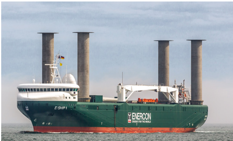
Figure 2. E-Ship – a RoLo cargo ship owned by Germany's Enercon GmbH. Four large rotorsails that rise from its deck are rotated via a mechanical linkage to the ship's propellers. The sails, or Flettner rotors, aid the ship's propulsion by means of the Magnus effect – the perpendicular force that is exerted on a spinning body moving through a fluid stream.

Disadvantages: solar power availability is global position dependent; solar energy is feasible as an augment to auxiliary power but photovoltaic processes are inherently of low effectiveness, even under the best of conditions, and require a significant deck or structural area upon which to place an array of cells.