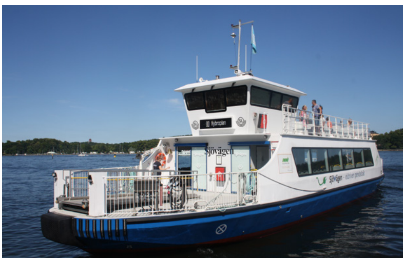
Fig.8. MS Sjövägen in the inner waters of Stockholm

Those are incredibly large machines to power with electricity, but it is economically viable and reduces local emissions. They are already similar ferry routes going electric, but nothing of this magnitude in term of size.