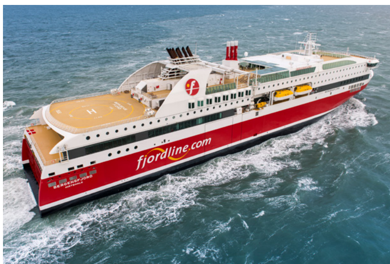
Fig. 9. M/S "Bergensfjord"

operators transporting containers from the large European container hubs. The vessel is primarily used on one of Unifeeder's routings between Rotterdam, The Baltics and Poland. C/v "Wes Amelie" is the first vessel of its kind worldwide that has been converted to an LNG propulsion system.