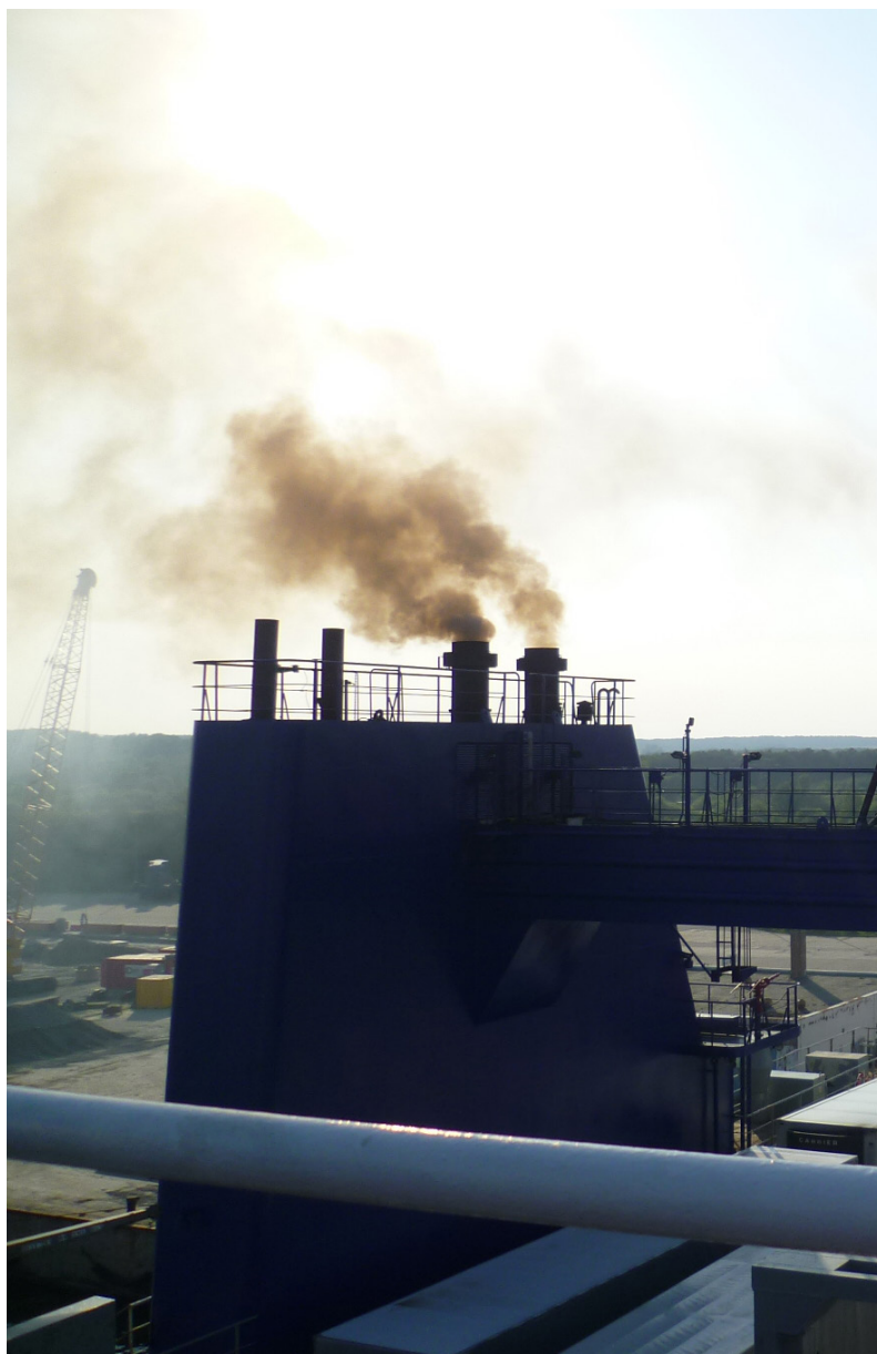
Ship exhaust fumes.

This Overview has been prepared as part of the EnviSuM project (Environmental Impact of Low Emission Shipping: Measurements and Modelling Strategies). The EnviSuM project addresses measurement and modelling strategies to assess present and future cost and the health and environmental effects of ship emissions in view of the IMO emission regulations that entered into force in January 2015. HELCOM’s role is to provide policy linkage to the project, to promote the project outcomes and facilitate involvement of the competent authorities from the Baltic Sea region.