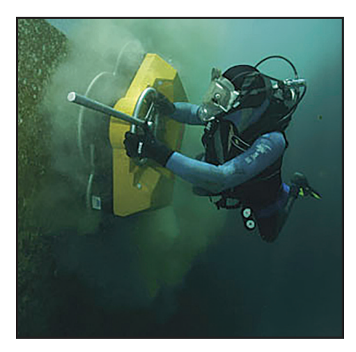
Figure 3.1: Underwater hull cleaning with no capture system evident

Aggressive cleaning has also been shown to reduce the efficacy of AFS coatings through excessive loss of metals / biocides and through roughening of the coating, potentially providing a surface at the microscopic scale to which organisms can attach (Oliveira and Granhag, 2016). In addition Oliveira and Granhag (2016) show that attachment of macro-foulers to epoxy based coatings is very strong and they recommend not cleaning such macro-fouling underwater due to coating damage and loss of biological material through shell shattering. This aspect acknowledges that there is coating damage and indicates that, as this is realised, there is a concomitant loss of polymer material potentially becoming biologically available microplastics.