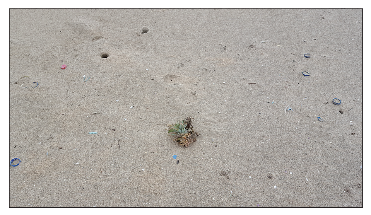
Figure 2.1: Plastics near ghost crab burrows, Cape Vidal World Heritage Site, South Africa