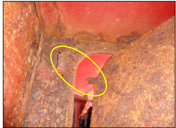
Figure 6: Broken hinge

Taking into consideration the condition of all the inspected cargo hold access covers, the safety investigation concluded that the covers had not been thoroughly inspected as part of a maintenance regime applied on board and may have even been missed, given that they were rarely used and always kept in the open position.