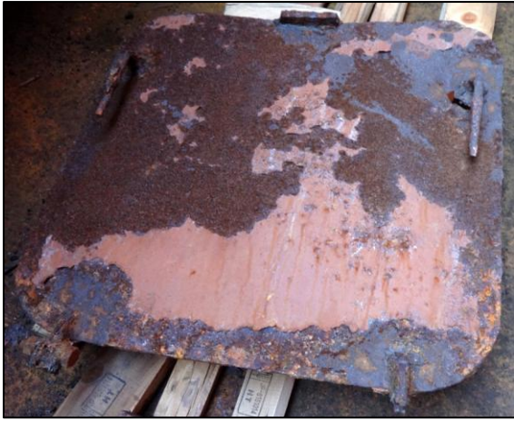
Figure 4: Material wastage signs and failed of hinges

It was clear to the safety investigation that the hinges and stopper failed while the stevedore was climbing his way up from the cargo hold. Moreover, the most logical sequence of events was for the stopper pin to fracture first, followed by the hinges (unless the hinges had already corroded away prior to the accident).