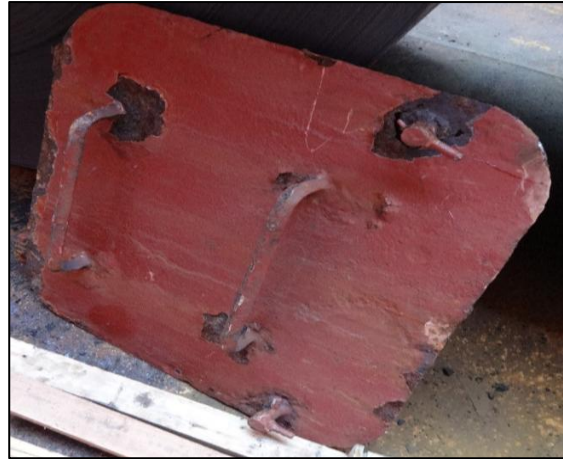
Figure 3: Cargo hold access cover as found at the bottom of the cargo hold.

The cargo hold access cover had signs of general corrosion. Material wastage was evident, suggesting that it had not been maintained over the months prior to the accident (Figure 3).