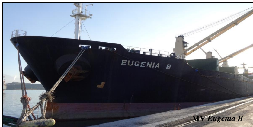
MV Eugenia B

The MSIU has issued recommendations to the flag State Administration and the Company designed to ensure that the company addresses the maintenance of critical fittings inside the cargo holds of vessels under its fleet.