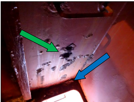
Figure 2: Broken stopper (green arrow) and broken hinges (blue arrow)

An inspection of the cargo hold access cover indicated it was also designed to help a person climb the vertical ladder. A stopper pin was fitted to keep the cargo hold access cover secured and in a vertical and open position. The MSIU found that the cargo hold access cover's stopper pin had been totally dislodged and the hinges had failed (Figure 2), in all probability while the stevedore was climbing out of cargo hold no. 2 5 .