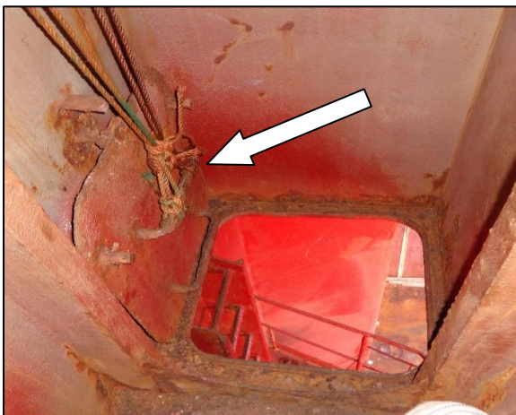
Figure 5: Cargo hold access cover in way of cargo hold no. 4

An additional cargo hold access cover was inspected during the course of evidence collection on board. The cargo hold access cover fitted in cargo hold no. 4 was found in a similar (poor) condition to that in cargo hold no. 2 (Figure 5).