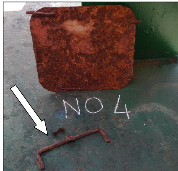
Figure 7: Broken stopper

Considering that the use was very limited and taking into consideration that there was no thorough knowledge of the physical condition of the grain hatch cover, the safety