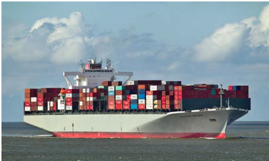
Pre-accident photo of Helsinki Bridge under way.

On December 6, 2017, at 0003 local time, the Panama-flagged containership Helsinki Bridge was moored in the Reserved Channel port side to the Paul W. Conley Container Terminal in Boston, Massachusetts. While the vessel was engaged in cargo operations at night during a period of moderate-to-high winds, a mooring bollard to which five of the vessel's head lines were secured failed. As a result of the bollard failure, the wind caused the vessel to drift away from the terminal and the remaining nine mooring lines to part. The vessel's bow then swung across the channel and struck the Raymond L. Flynn Black Falcon Cruise Terminal pier. There were no reports of pollution and no injuries among the 24 crewmembers and 10 longshoremen on board. The damage was estimated at $570,000 for the vessel and $40,500 for both terminals.