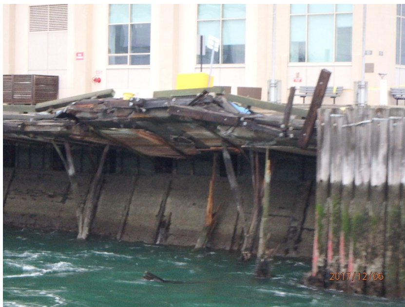
Damage to Black Falcon pier.

The tugboat Justice arrived on scene at 0032 to assist the Helsinki Bridge , followed by the Massport fire rescue vessel American United , which arrived about 10 minutes later. The two vessels remained with the Helsinki Bridge until another docking pilot arrived on board at 0140. The docking pilot then maneuvered the vessel to anchorage to await US Coast Guard investigators and response personnel. The longshoremen on board were shuttled back to the Conley Terminal by pilot boat.