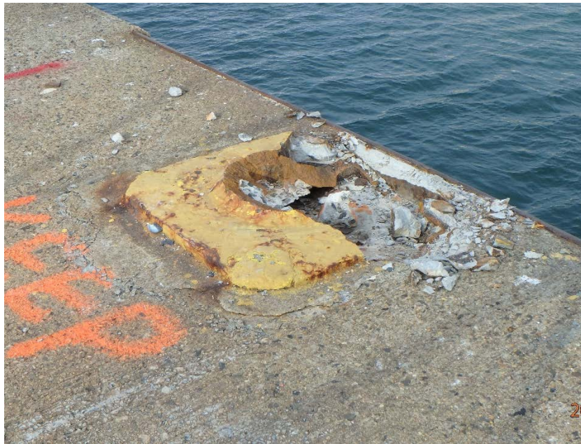
Remaining base of bollard that failed at Conley Terminal.

In just a few minutes, the remaining seven lines also parted, in succession from forward to aft, as the Helsinki Bridge continued to be blown out into the channel to almost a 45-degree angle from its berth.