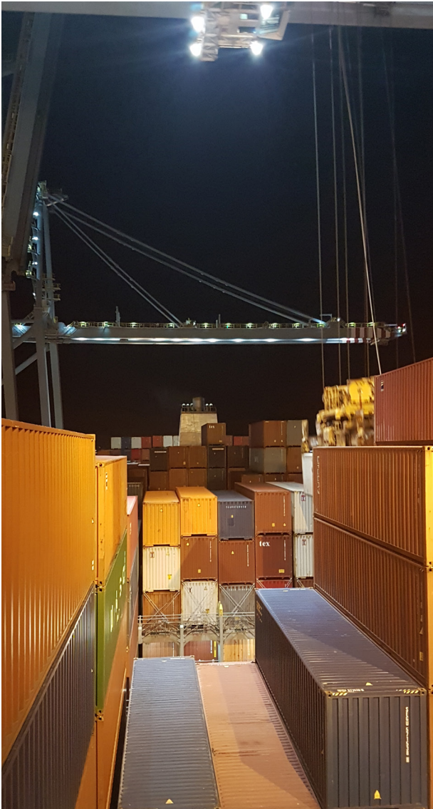
Image 5: The everyday rhythms and routines of the ship are driven by the core function of the ship; the transportation of goods across great geographical distances. Seafarer lives are lived alongside these rhythms.

Similarly, onboard Ship2, where participants had to rely on external methods of connecting, there was a culture of sharing knowledge about which sites to use in terms of reducing data consumption, which sellers to buy from and not to buy from to get the best deals on mobile phone sim cards, and in which ports to buy sim cards that would cover larger areas. For example, northern Europe was seen to be better than southern Europe and Asia because the cards covered larger areas – and not just one country (although these cards were also seen to be expensive by the crew). This culture of sharing knowledge and experience was particularly evident when new crew members joined the ship.