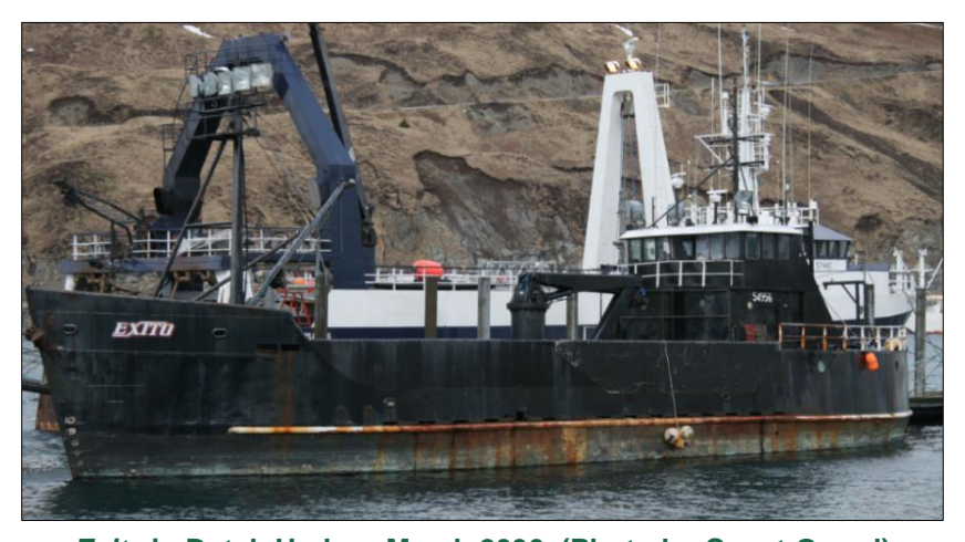
Exito in Dutch Harbor, March 2006.

On December 6, 2016, about 2140 local time, the uninspected motor vessel Exito sank while transiting from Dutch Harbor to Akutan, Alaska. During the transit, the vessel had been struck by a wave and began listing to starboard. Unable to determine the source of the list as it progressively increased, the captain ordered the Exito 's second crewmember and three contractors who were also on board to don immersion suits and abandon the vessel. The crew and one contractor evacuated to a liferaft, but two contractors were unable to escape the Exito before it sank. The survivors were recovered shortly after by a good Samaritan vessel. US Coast Guard aircraft, a Coast Guard cutter, and other vessels searched for the missing contractors, but they were never found. About 2,000 gallons of diesel fuel, twelve 55-gallon drums of anti-freeze, and an industrial X-ray machine were released into the sea when the vessel sank. The Exito , valued at about $310,000, was lost.